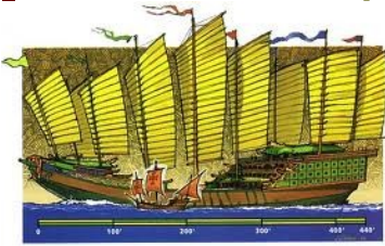
Zheng He vs Columbus-a fair fight?