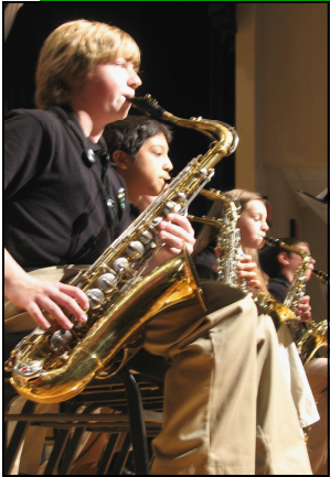
2008 Fall Jazz Concert

For more information or to find out how you can become part of the Buford Band Program, contact one of our directors.