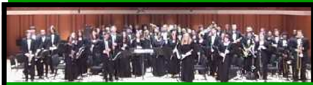
Buford High School Symphonic Band SUPERIOR Ratings GMEA Large Group Performance Evaluation